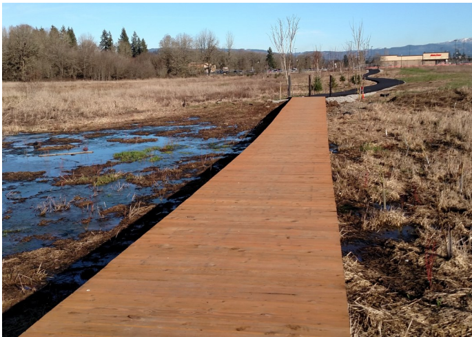
East view of the new wooden boardwalk built over a portion of the wetland area.

This 80 acre site was purchased in 2000 from the Remy family for future recreation and open space purposes. Currently it is the site of a 60 acre wetland mitigation project managed by Habitat Bank NW.